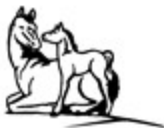
HORSE COLT LAYING