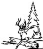
DEER JUMPING W-TREE