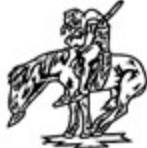
END OF TRAIL-A