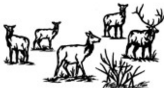
COW ELK GROUP