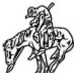
END OF TRAIL-B